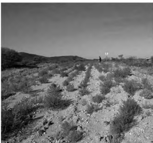
Fig. 4. Salsola population on the Landor Road, WA.

referrable to S. tragus as was done by Rilke in 1999. The study undertaken by Borger et al., was very parochial and only covered a small area of the south west of the continent so there is a need for a detailed Australia-wide study of Salsola to be undertaken, combining morphology, ecology, cytology and molecular analyses, before any meaningful taxonomic sense of the genus in Australia can be achieved.